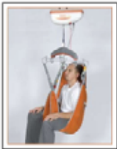
Ceiling and Stair Lifts