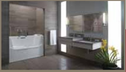
The Bold Look of Kohler

We can work with you to plan and remodel your home to make it safe, comfortable and beautiful. We are a CAPS (Certified Aging in Place Specialist) trained contractor and enjoy working with clients to help you remain independent. We are here to make sure your home meets those needs.