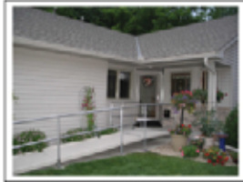
Modular Wheelchair Ramps