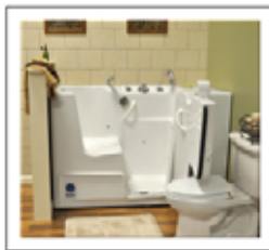
Long Term Bathing Solutions